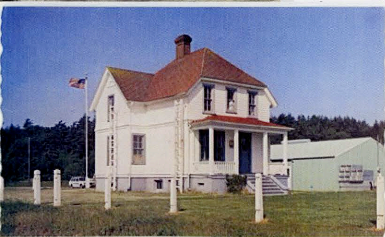
Marrowstone Point Lighthouse, Fort Flagler State Park, Washington